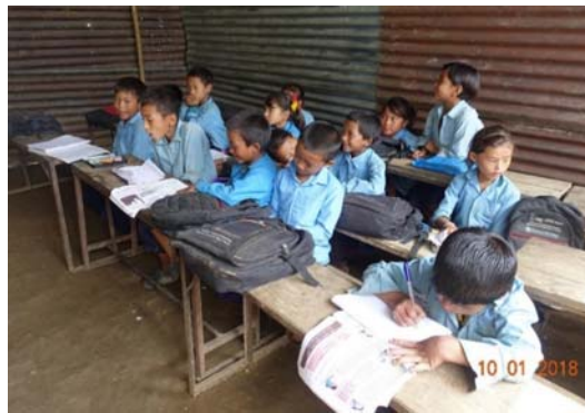
Students at the temporary school at Ghormu.