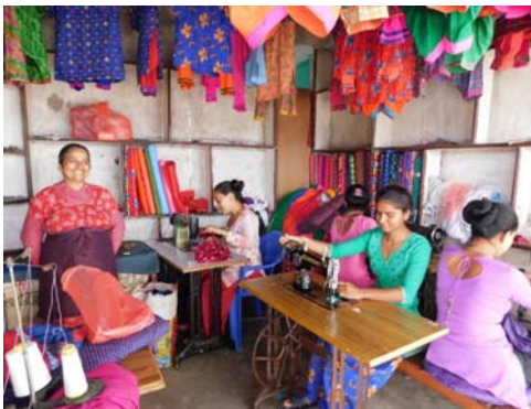
Sewing shop in Jibajibe

Kathmandu had almost a remote and rural feel to it in 1977. Just outside the city were rice fields and harvest was done by hand, pounding the rice then grinding it into flour