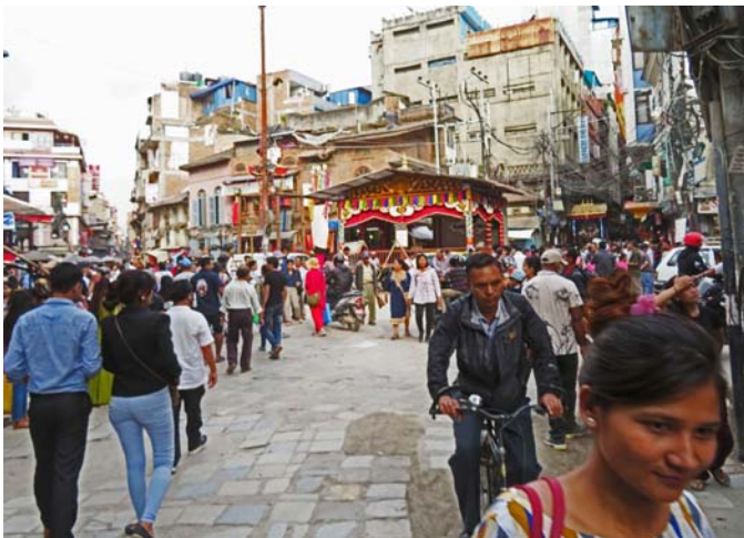
The busy streets of Kathmandu

The differences from the 1970's to now are many but there are also many familiar features. The population of Nepal was about 13 million in 1977 and is about 29 million in 2018. Kathmandu and area now has 2.5 million people. In 1977 it was much smaller, but it's still a city of narrow streets, brilliantly coloured market stalls and shops, and crowds of people in the streets comfortably moving around each other, shopping, chatting and eating.