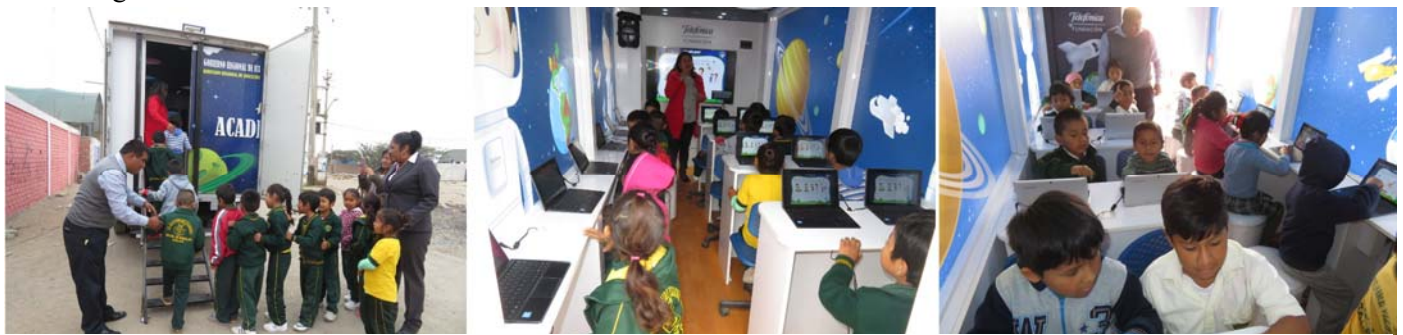
The Tec-Bus mobile computer classroom

Since the Tec-Bus has been in operation, it has served an estimate of 2,100 students in 8 schools and 167 teachers in the region. It is evident that the students are eager to attend classes in the Tec-Bus. The experience is stimulating and fun and promotes confidence and self-identification. It confirms the studies that the best form of promoting learning is through creativity, play and diversion. It provides knowledge of other opportunities