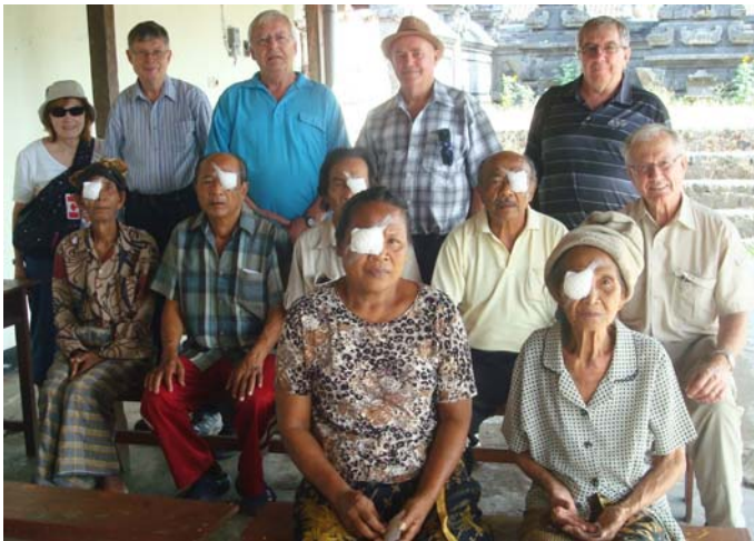
Cataract patients in Bali waiting to have their bandages removed.

Sometimes the Rainbow of Hope partners with other non-governmental organizations from the developed part of the world. One example of this is the John Fawcett Foundation (JFF) from Australia. They work with needy people in islands around Bali, Indonesia mainly in sight restoration, blindness prevention, and cleft palate surgeries. They set up mobile clinics to screen patients, do surgeries, and provide glasses and other vision-related medical services. They have screened over a million people so far. Rainbow of Hope provided funds to support some of their mobile clinics. In their most recent newsletter they indicated that they had issued glasses to 477,247, treated 582,478 for infections and did 52,701 cataract surgeries. Thirty-six people received artificial eyes, custom made for them.