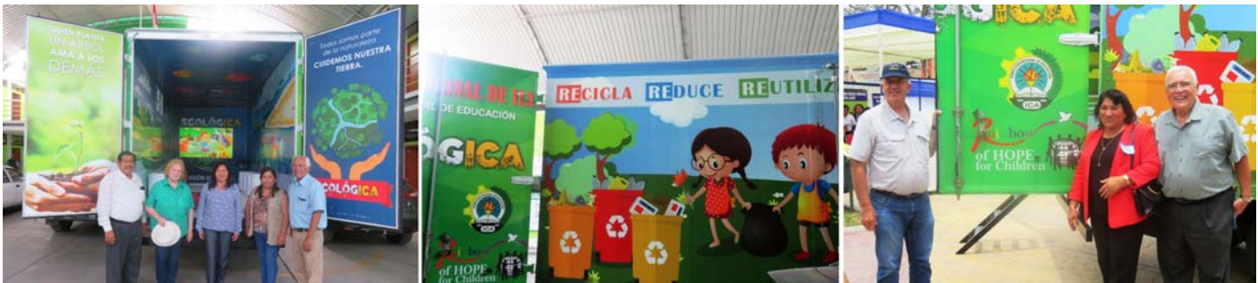
The Mobile Ecological Project

The Ministry of Education staff is grateful for the financial and academic support for the mobile projects and other projects promoting the education for children and adults. ☺