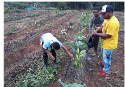
School of Family Agriculture, Brazil

Casa Ambrosina - Empowerment of young women, Alagoas, Brazil : This project has been going for just over a year. They are teaching communications, providing some therapy and teaching English to young women in the Maceió area. Their target group has few job prospects and have often had trauma in their lives. The Al Gerwing Foundation is a supporter of this project.